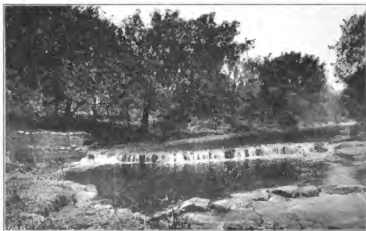
WHITEWATER FALLS NEAR TOWANDA.

Whitewater River. —This stream rises in the southern part of Marion county about 6 miles west of the village of Burns, flows south and unites with the Walnut river at a point about a mile south of the town of Augusta, Butler county. The stream has only one tributary of consequence—the West Whitewater—which has its source near the town of Walton in Harvey county, and unites with the Whitewater a little north of the village of Towanda, Butler county. The length of the